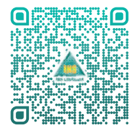
LifeGuard SmartCarer app iOS