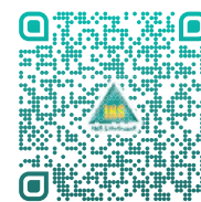
LifeGuard SmartCarer app Android